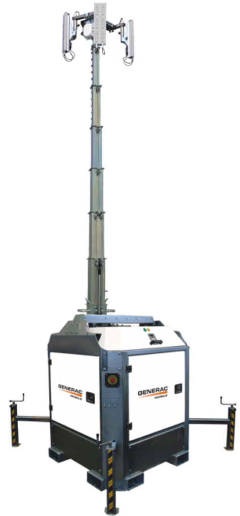
Picture shown may not reflect actual configuration.