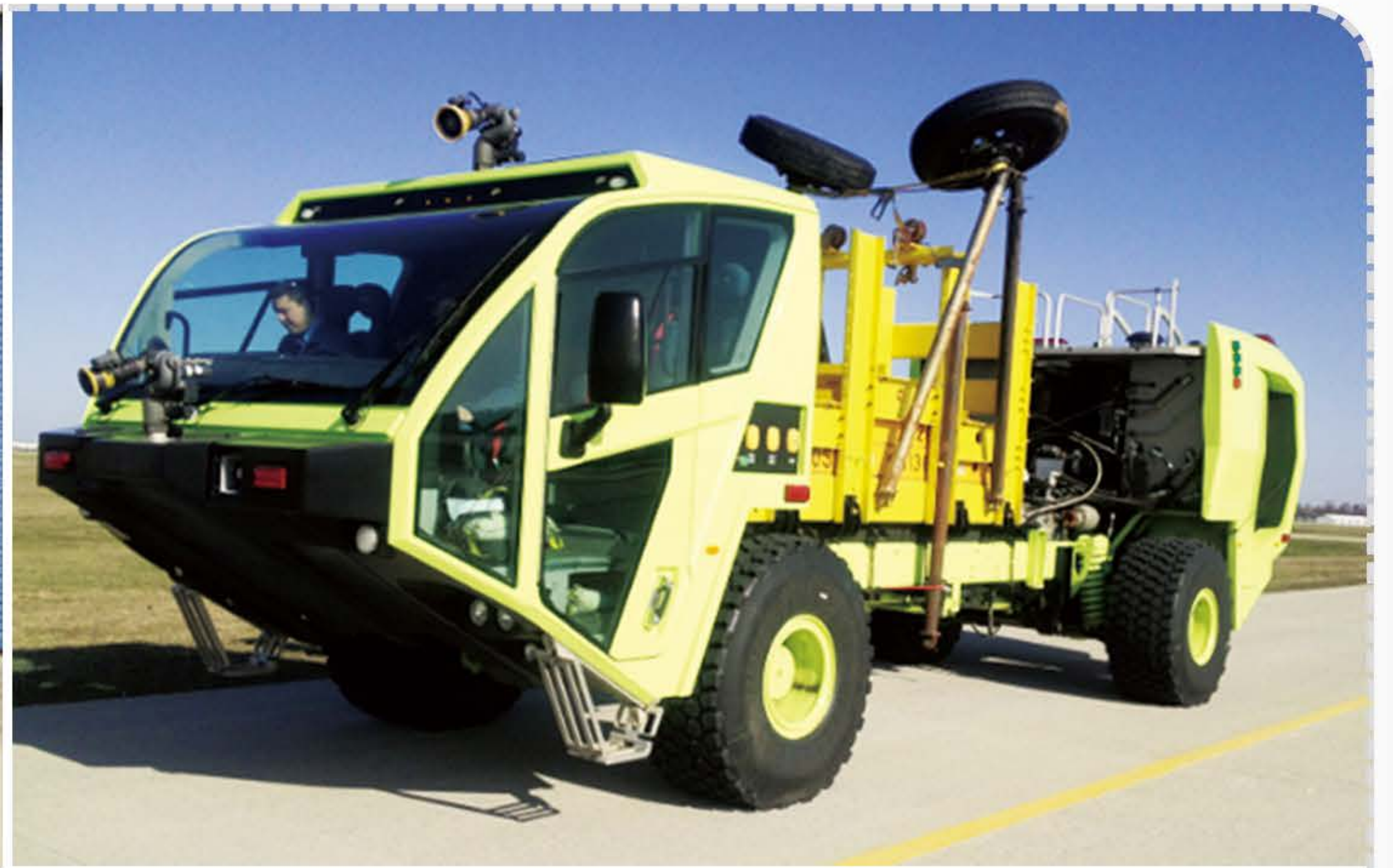
24.00R21 ETMT with Oshkosh fire truck in USA