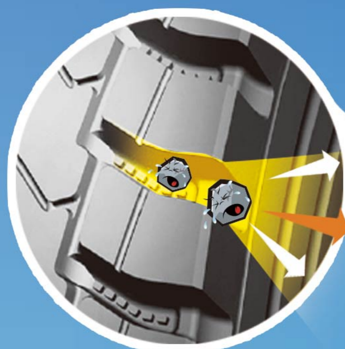
Stone Shy Design for avoiding groove puncture