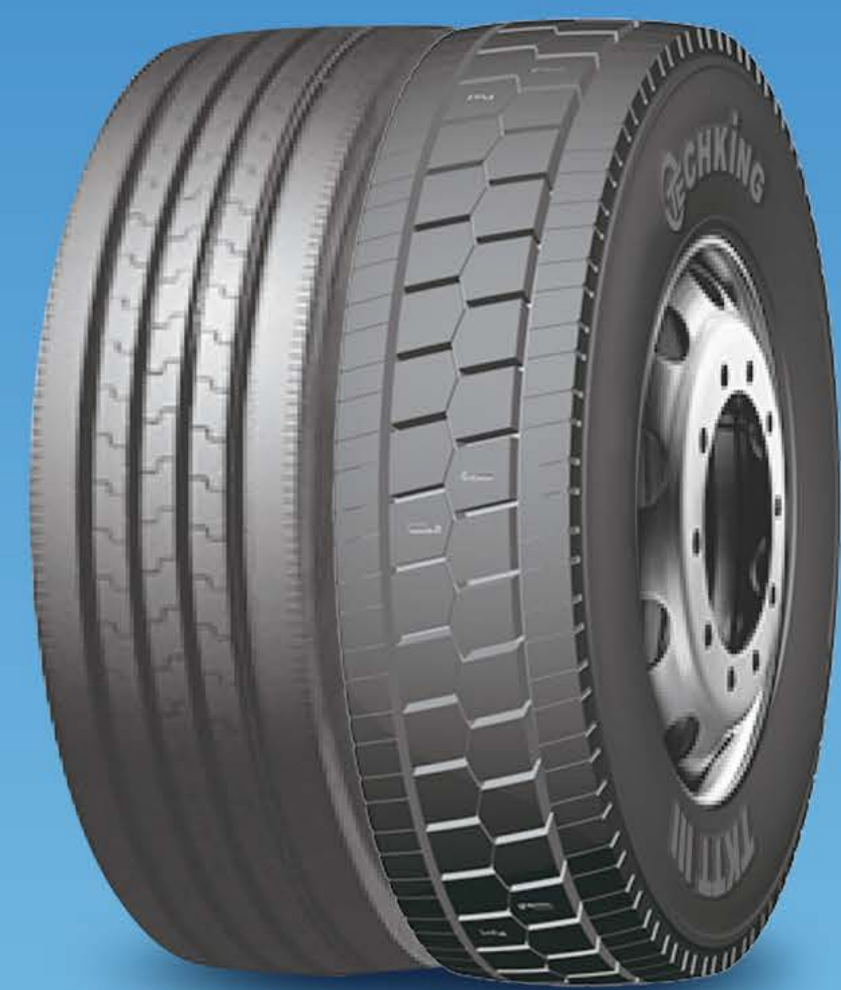
TKTT TKTT III